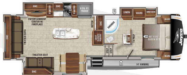
30.5CKTS A, C, E, F, G

Ext. Lgth: 32' 9" Weight: 9,345 lbs. Hitch: 1,690 lbs.