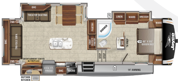
28.5RSTS A, C, E, G

Ext. Lgth: 32' 8" Weight: 8,950 lbs. Hitch: 1,675 lbs.