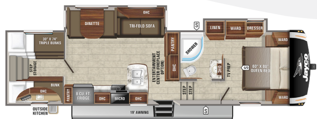
29.5BHOK A, D, E, F, G

Ext. Lgth: 34' 7" Weight: 9,385 lbs. Hitch: 1,820 lbs.