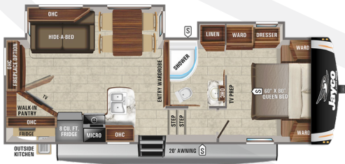
25.5REOK A, B, C, E, G

Ext. Lgth: 29' 2" Weight: 8,290 lbs. Hitch: 1,440 lbs.