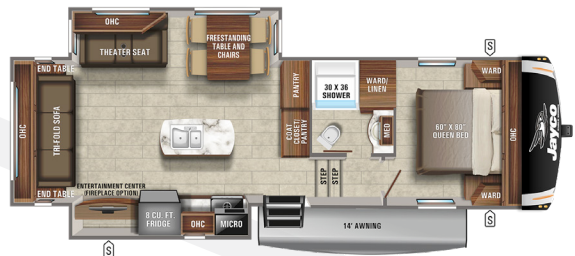
27RS A, C, E, G

Ext. Lgth: 29' 2" Weight: 8,290 lbs. Hitch: 1,440 lbs.