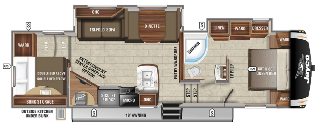
29.5BHDS A, B, D, E, G

Ext. Lgth: 33' 11" Weight: 9,430 lbs. Hitch: 1,805 lbs.